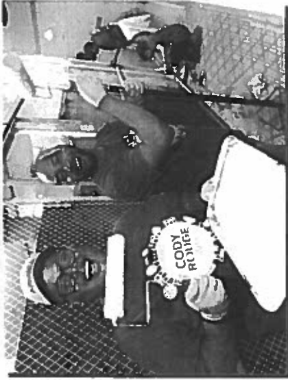
Volunteers participating in neighborhood improvement efforts

To achieve full implementation of this plan, we have identified the investment needed over the next five years.