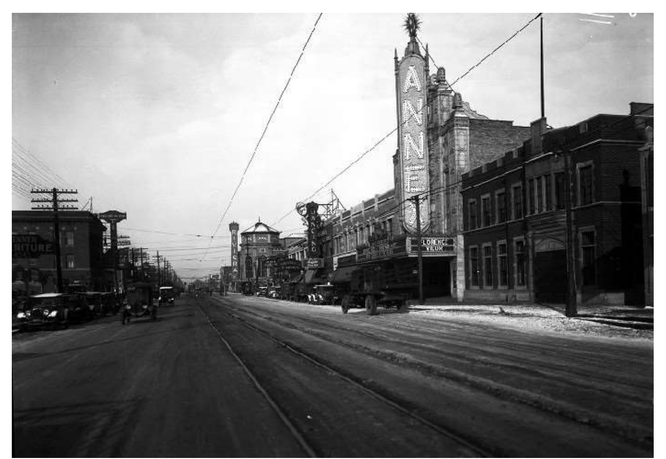
Grand River Avenue between Beverly Court and Joy Road circa 1930. Detroit Fire Department Engine Co. 42 and marquees for Riviera Annex Theater, the Mirror Ballroom, and the Grand Riviera Theater at right. Grande Ballroom would be at right behind photographer.

The construction of the Grande Ballroom in the autumn of 1928 is the product of the twin forces of a widespread, popular interest in ballroom dancing, and the physical growth of the city of Detroit, particularly its growth northwesterly from the city center as illustrated by the development of the Petosky-Otsego neighborhood and the commercial development centered on the intersection of Grand River Avenue and Joy Road, approximately five miles from downtown Detroit.