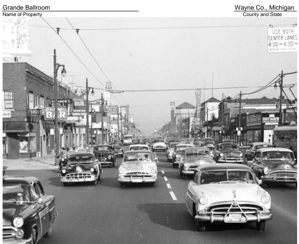
Grand River Avenue near Clarendon Street, looking east, with marquees for the Grande Ballroom and Grand Riviera Theater in background at right. Undated.

United States Department of the Interior National Park Service / National Register of Historic Places Registration Form NPS Form 10-900 OMB No. 1024-0018