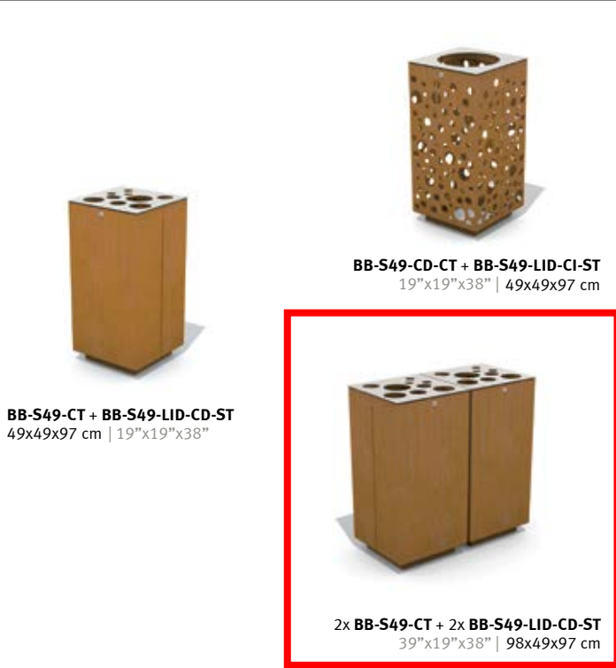
BB-S49-CT + BB-S49-LID-CD-ST 49x49x97 cm | 19"x19"x38"