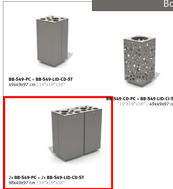
BB-S49-PC + BB-S49-LID-CD-ST 49x49x97 cm | 19"x19"x38"