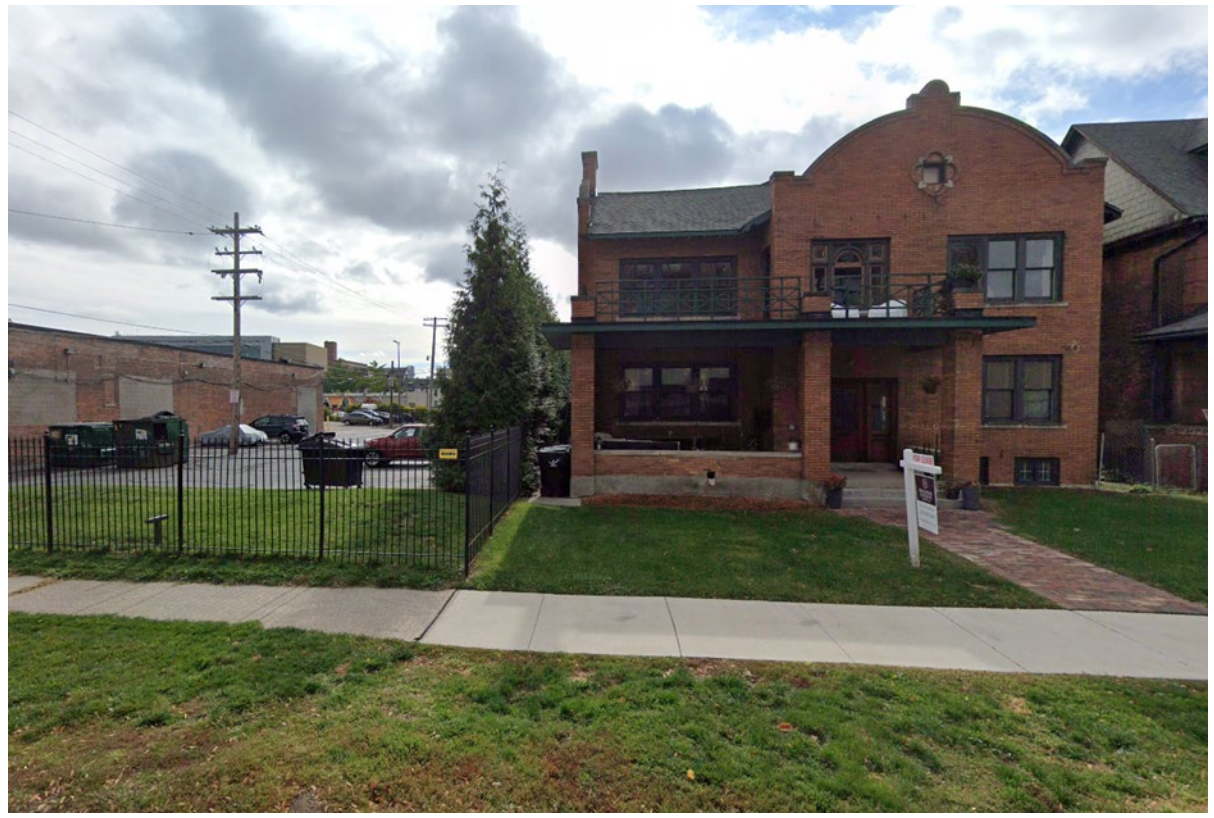
Looking south at adjacent apartment house