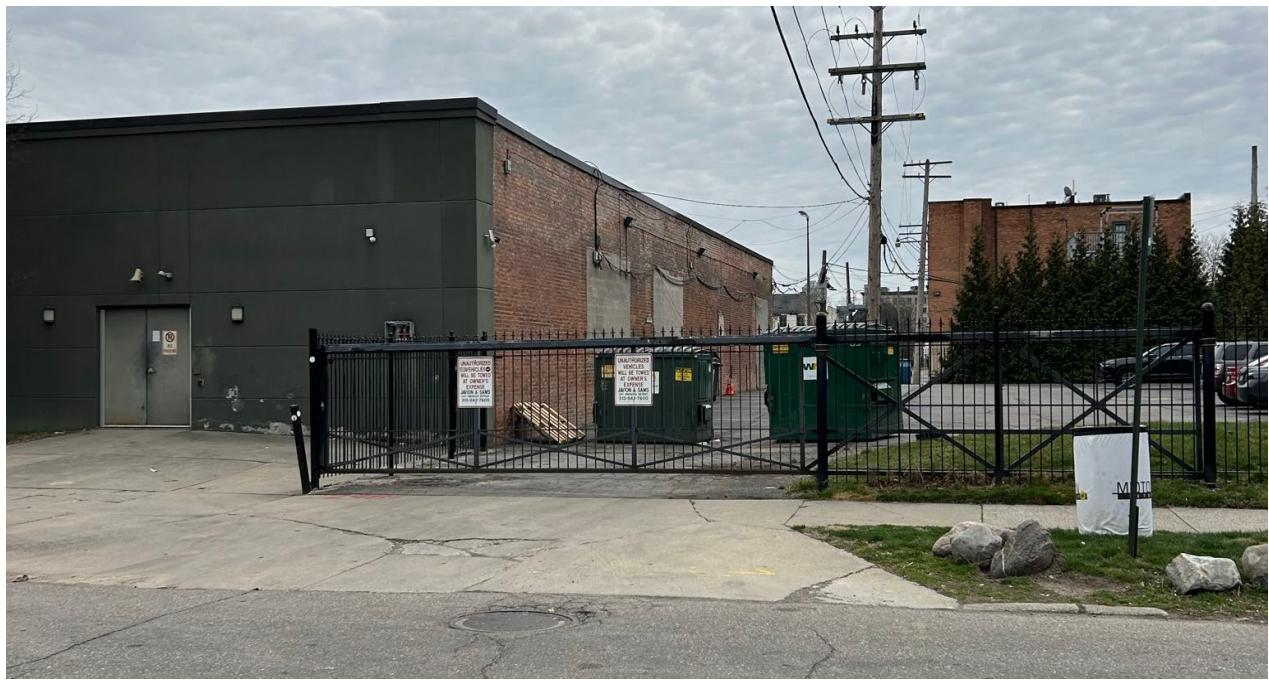
Looking south to adjacent commercial building, sliding gate and trash dumpsters

Existing asphalt paved parking lot will be downsize from a 26 car parking lot to a 12 car parking lot. Existing trash dumpsters that serve the commercial building to the east will remain. The large arborvitae shrubs will be removed. The overhead utilities lines are in the process of being removed. There is a 20' wide easement along the commercial building from a vacated alley.