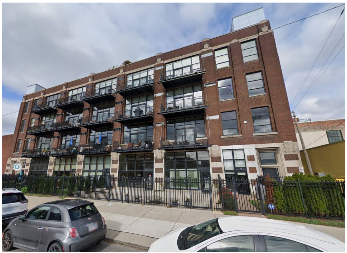
Looking north at the Willys-Overland Residential Lofts