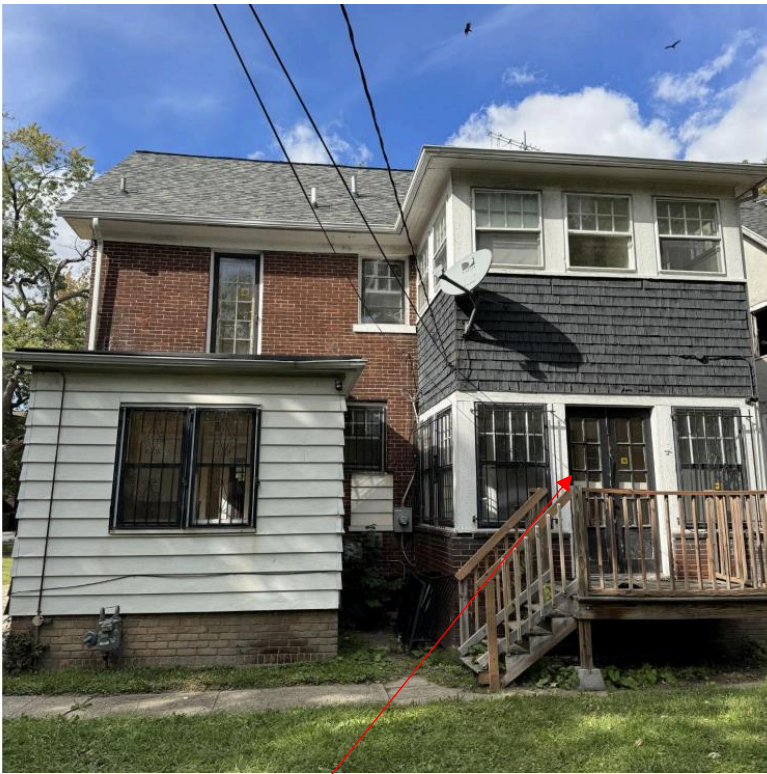
Rear of home, prior to unapproved work, facing north. Note the condition of the French doors proposed for removal