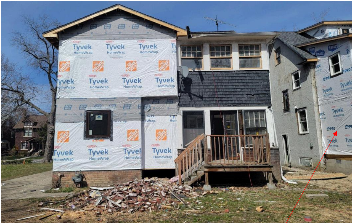
1485 Longfellow, current conditions. Facing north towards rear elevation. Note new two-story addition which was erected without HDC approval. Also, note that a new addition has been added to the rear of the house next door/1475 Longfellow without HDC review/approval. 1475 and 1485 Longfellow are owned by the same person