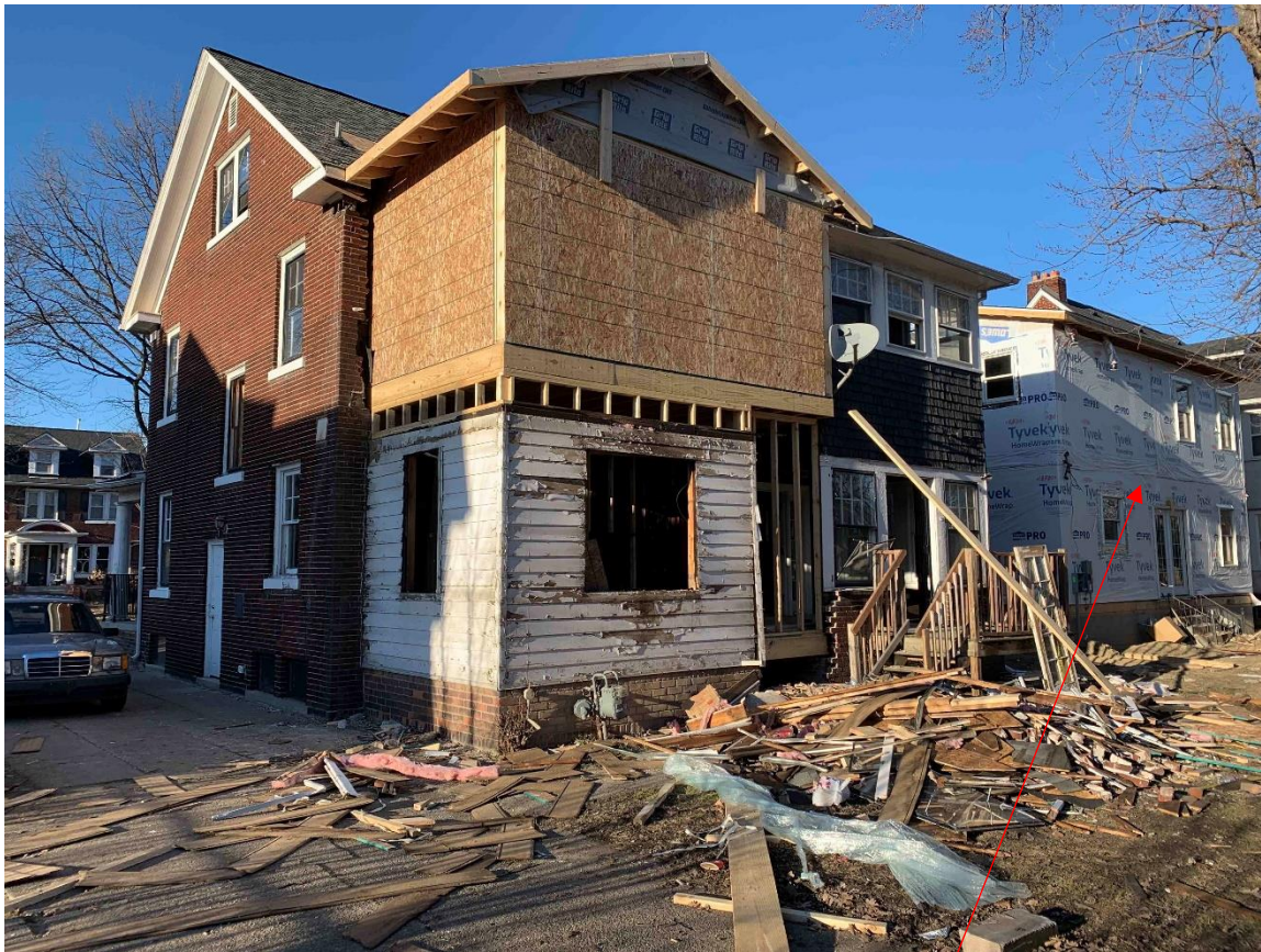
Photo showing home on 2/14/2024. Submitted by resident. Facing northwest, showing unapproved work at rear (outlined in yellow). Also, note that a new addition had been added to the rear of the home next door/1475 Longfellow without HDC review/approval. 1475 Longfellow is also owned by owner of 1485 Longfellow