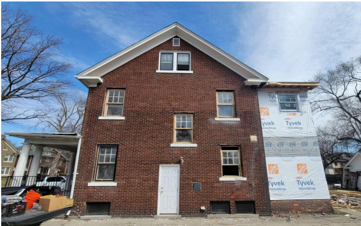
1485 Longfellow, current conditions. Facing south. Note new two-story addition which was erected without HDC approval.