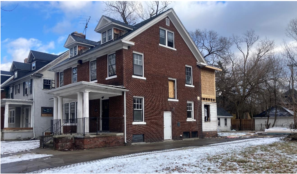
Photo showing home on 2/14/2024. Facing southeast, showing unapproved work at rear