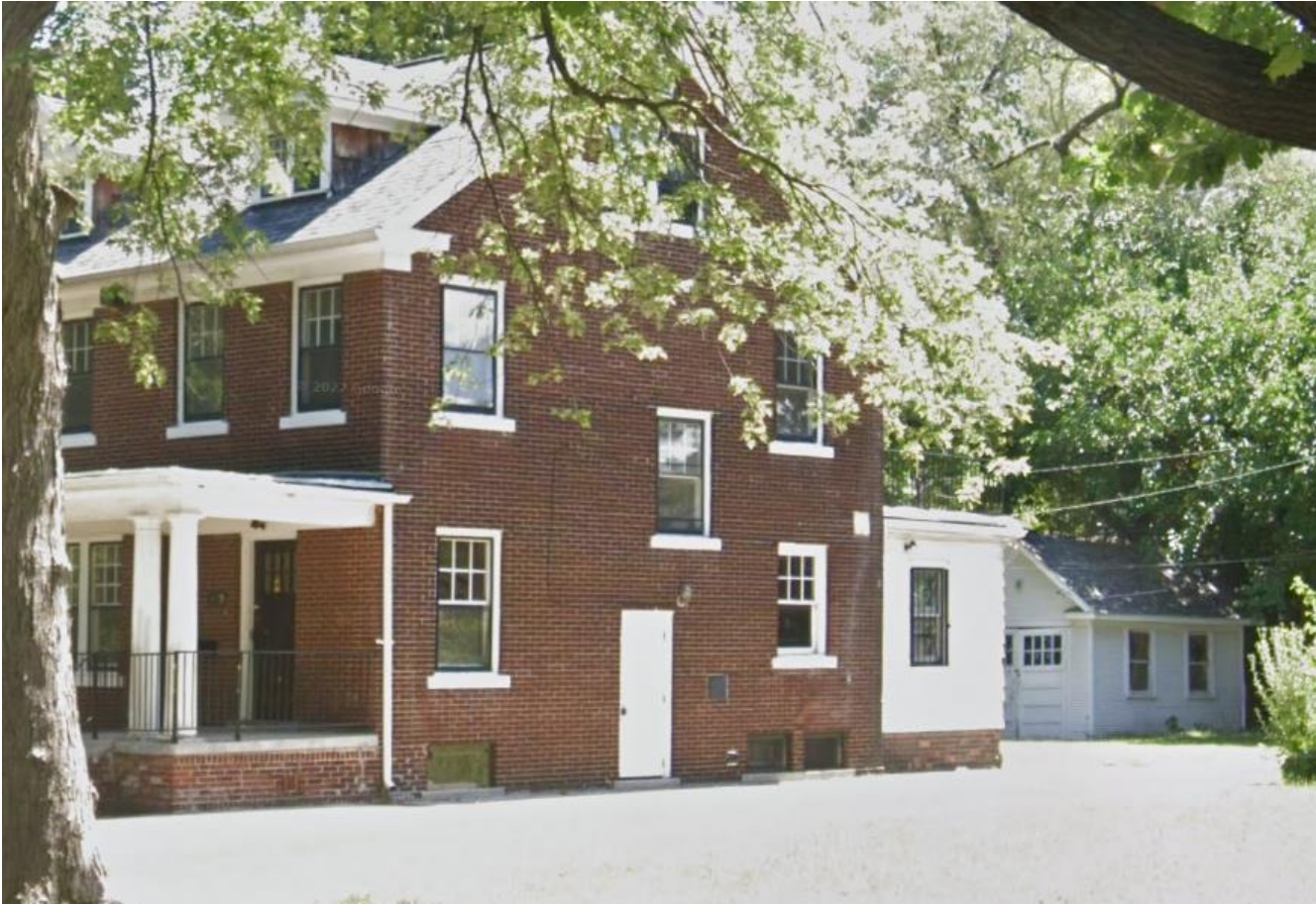
Google Streeview image, 2022. Facing southeast