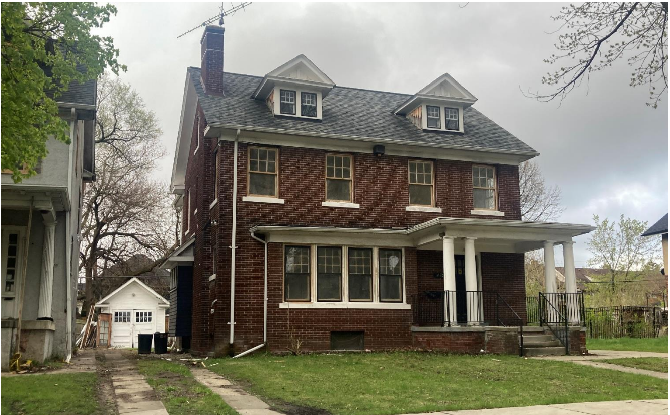
1485 Longfellow, current conditions. Facing southwest. Staff photo taken on 4/22/2024

The building located at 1485 Longfellow is a single-family house that was erected ca. 1920. The building features a two-story, side-gabled main mass which is clad with brick and a two-story, flat-roof wing with wood shake siding at the rear elevation. A gabled-roof, two-story addition was recently erected at the building's rear wall without Historic District Commission approval. Gabled-roof dormers top the building's roof. A partial-width, flat-roof porch with round wood columns is located at the building's front elevation. Windows are the original double-hung, wood-sash units.