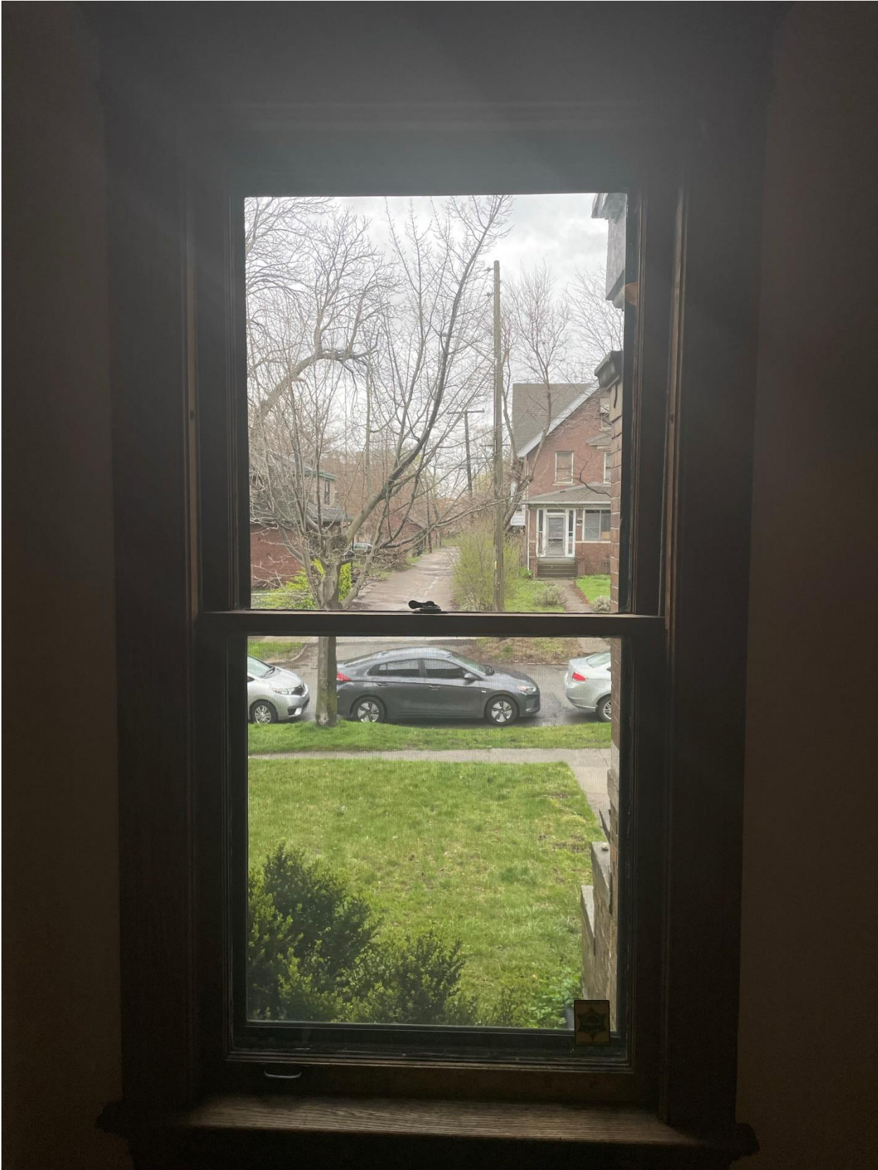
First floor south Window #1