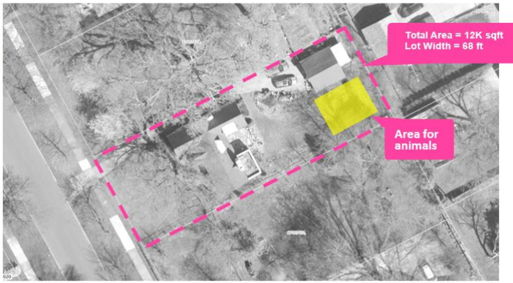
One lot at 12K sqft