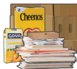
Cereal Boxes, Newspaper, Magazines and Mail, Flattened Cardboard & Paper Tubes